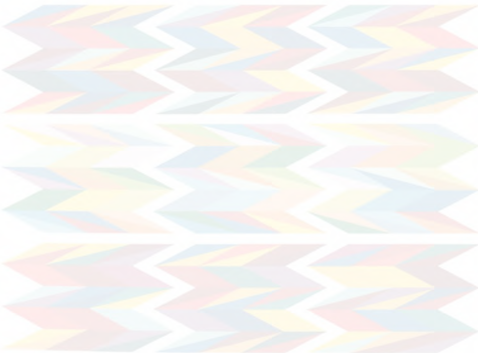
Odili Donald Odita, Constellation , 2018. Design proposal for mural

The word "region" is related to "reign." It refers to territory but also to authority. Region is not a benign term. Embedded in a region are questions about who and what should be here. What is appropriate by virtue of its nativeness? Who speaks for this place, and by what moral authority? Regions come with boundaries and barriers. Politics and infrastructure sometimes align with geological terrain. In my own field—landscape architecture—there is a lamentation that we don't often organize ourselves politically along geologic lines.